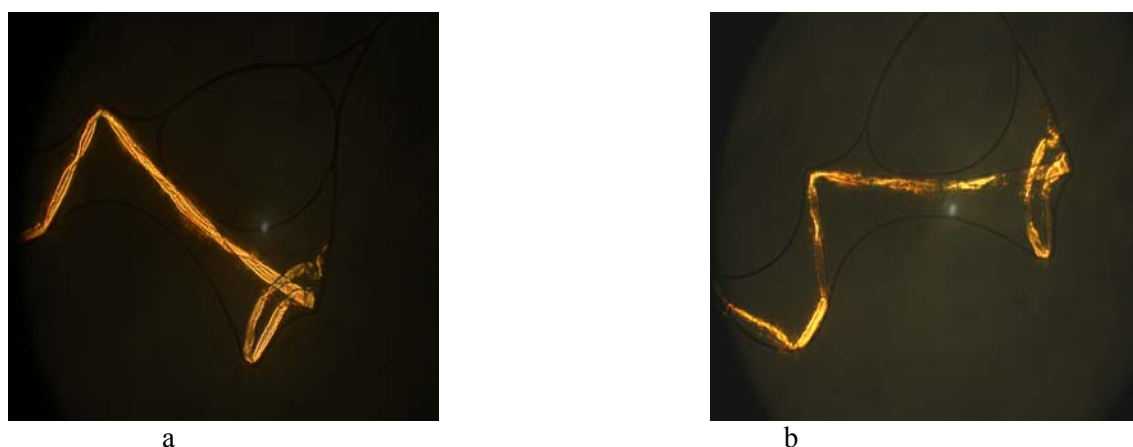
Figure 3 The Influence of radiation on water biological molecular system - 5 % of lecithin in water: a – 1 Sv/hour, the time of exposition is 3,6 seconds;

The researches of \gamma - radiation and \alpha - radiation interaction with water systems of lecithin were carried out. Ordering of the structures has allowed establishing the markers of the threshold of direct collisions. The results are presented in figure 3. From the presented data it is visible that the big section of interaction the \alpha - particles with a target considerably reduces the threshold of the direct collisions activity.